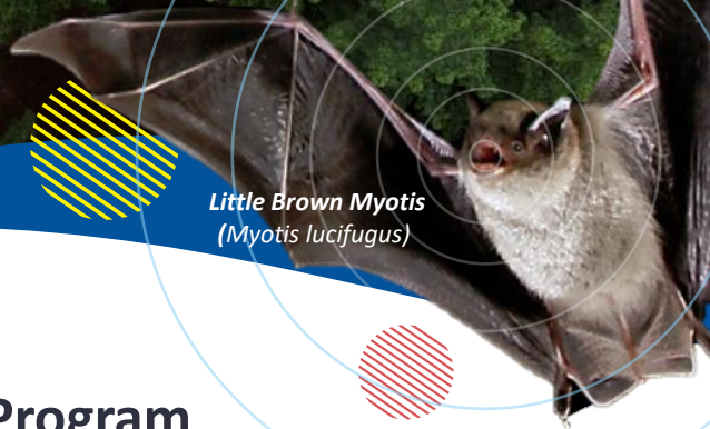
Little Brown Myotis ( Myotis lucifugus )