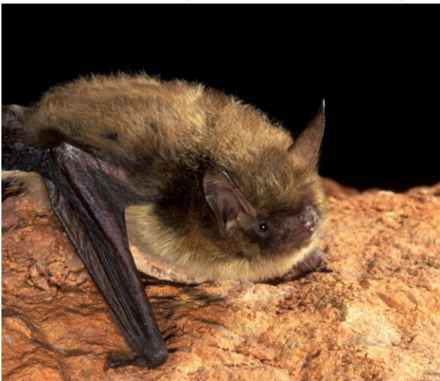
Northern Myotis (Myotis septentrionalis)