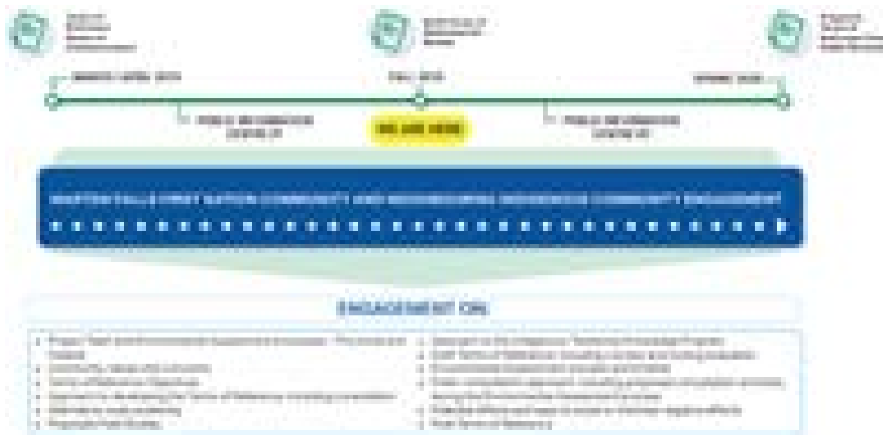
Figure 10-2: ToR Consultation Activities